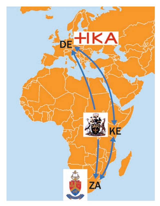
A trilateral North-South project cooperation

In September 2023 a joint summer school with 18 students is planned at HKA for an active testing of the teaching building blocks developed by then. Relying on virtual participation only is questionable for a sustainable university cooperation aimed at integrating students: it is essential that personal and intercultural student exchange takes place beyond the actual project work, e.g. through socializing. Exchange is further supported by 10 individual scholarships for an entire semester or a final thesis research period at HKA, UP or UoN over a period of three years up to 2025.